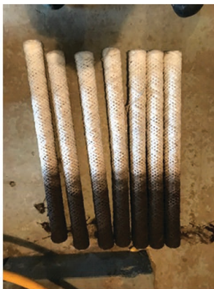
Result of not purging air